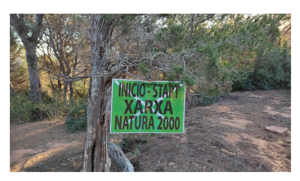
Information sign at the beginning of the Natura 2000 area.