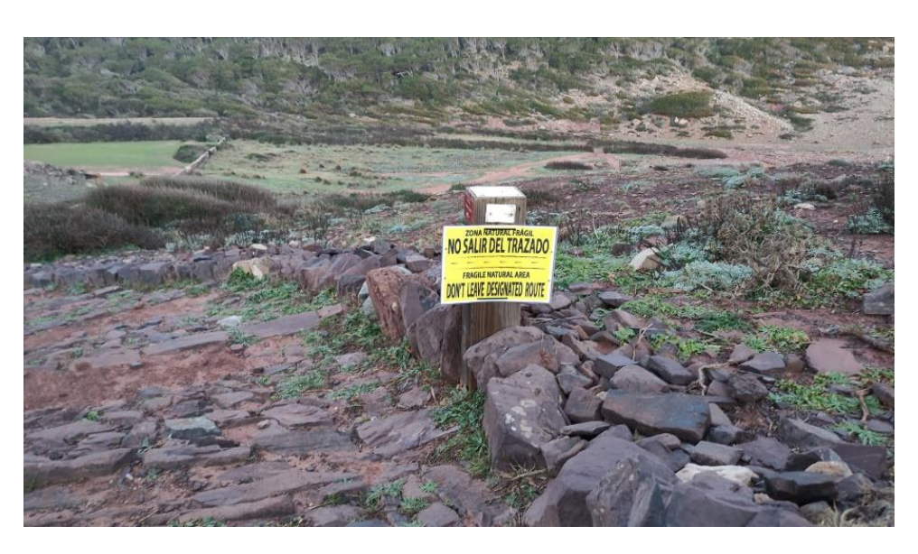
Information sign not to leave the marked path.