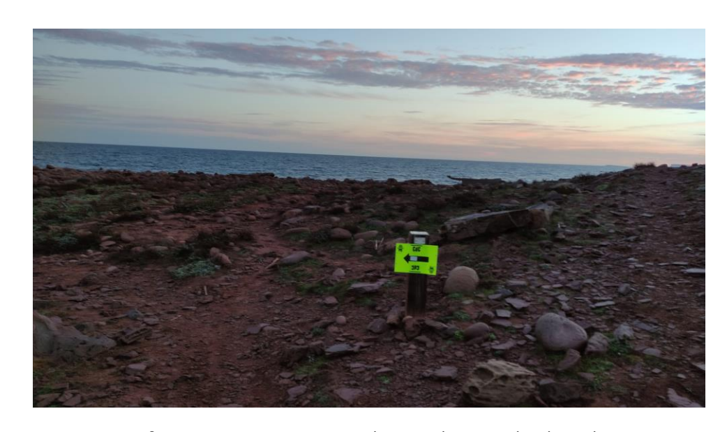
Information sign not to leave the marked path.