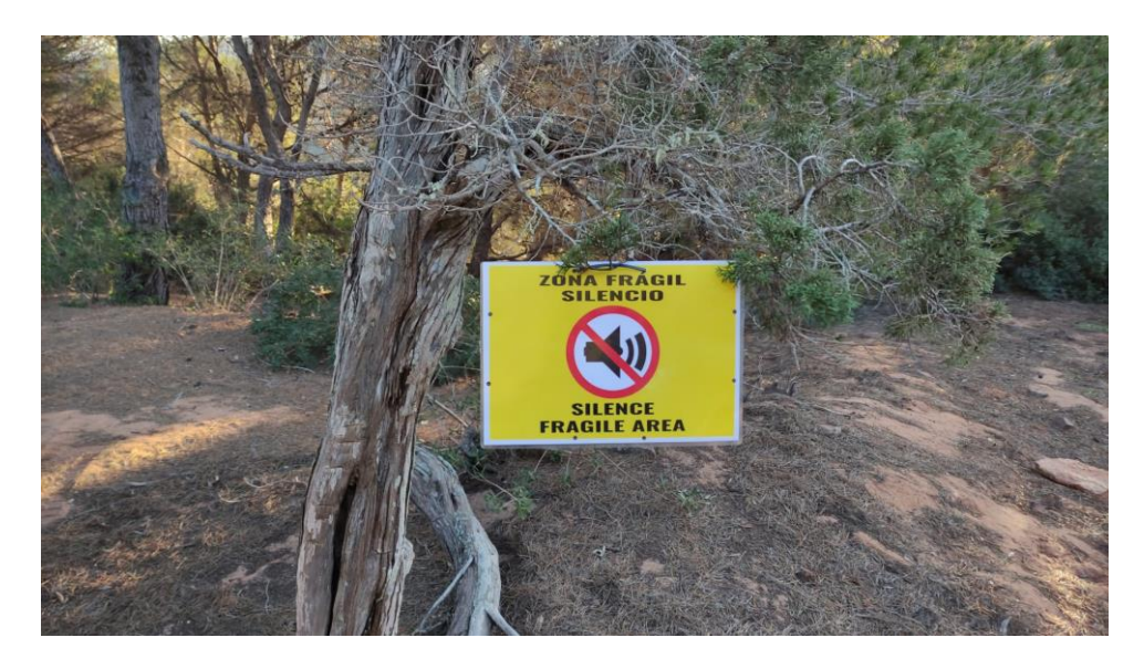
Fragile zone of silence information sign, placed in Natura 2000 areas and the South parking area of La Vall.